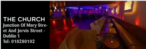
THE CHURCH Junction Of Mary Street And Jervis Street - Dublin 1 Tel: 018280102