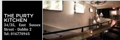
THE PURTY KITCHEN 34/35, East Sussex Street - Dublin 2 Tel: 016770945

Opening hours: Open seven days a week, from 22:00 to late.