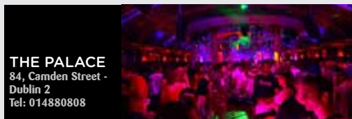
THE PALACE 84, Camden Street - Dublin 2 Tel: 014880808

Opening hours: The Mezz is open seven days a week, from 17:00 to 23:30 (00:30 Friday and Saturday, 23:00 Sunday). Thinktank opens Wednesday from 19:00 to 03:00, Friday and Saturday from 22:00 to 03:00.