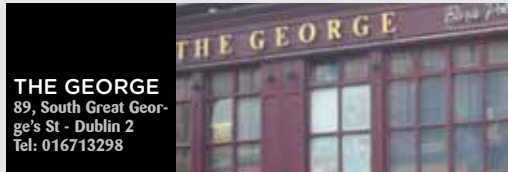
THE GEORGE 89, South Great George's St - Dublin 2 Tel: 016713298

Opening hours: Open seven days a week, from 12:00 to 23:30 (01:30 Thursday, 02:30 Friday and Saturday, 23:00 Sunday).