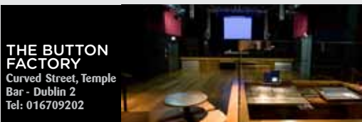
THE BUTTON FACTORY Curved Street, Temple Bar - Dublin 2 Tel: 016709202

Opening hours: Opening times vary depending on schedule – turn to event listings or visit www.2night.ie for details.