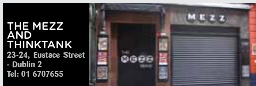
THE MEZZ AND THINKTANK 23-24, Eustace Street - Dublin 2 Tel: 01 6707655