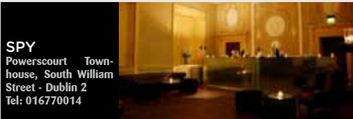
SPY Powerscourt Townhouse, South William Street - Dublin 2 Tel: 016770014

Soundcheck, the Thursday night club, has organised everything from a screening of Tommy Wiseau's cult film The Room to a flash mob apparently intended to mark the death of the phenomenon. It's a sign of a club that prides itself on being relentlessly, obsessively plugged into twentysomething culture. Spy is fun for all that, though, and the Georgian townhouse setting is cool.