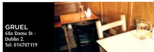
GRUEL 68a Dame St - Dublin 2. Tel: 016707119

An example of how suburban pubs should operate, Coman's boasts an expansive and comfy dining room and bar, very attentive service, and a menu of pub-grub staples mixed with some safe-but-tasty international dishes. Bangers and mash comes with our seal of approval, as does any dish involving chicken – filling, warming and tasty fare. Opening hours: Open seven days a week, from 10.30 (12:00 Sunday) to 23:30 (00:30 Friday and Saturday, 23:00 Sunday).