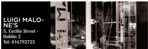
LUIGI MALONE'S 5, Cecilia Street - Dublin 2 Tel: 016792723

Opening hours: Open seven days a week, from 08:00 (10:00 Sunday) to 22:00.