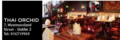
THAI ORCHID 7, Westmoreland Street - Dublin 2 Tel: 016719969

Opening hours: Open seven days a week, from 12:00 to late.