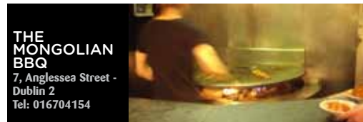
THE MONGOLIAN BBQ 7, Anglessea Street - Dublin 2 Tel: 016704154

Opening hours: Open seven days a week, from 12:00 to 21:00 (22:00 Thursday to Saturday). Bar open to 23:30 (23:00 Sunday).