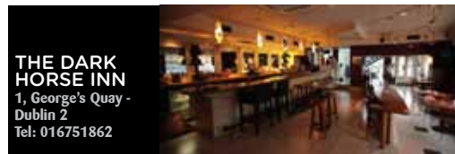
THE DARK HORSE INN 1, George's Quay - Dublin 2 Tel: 016751862

Opening hours: Open seven days a week. Lunch served from 12:00 to 18:00, dinner from 18:00 to 00:00.